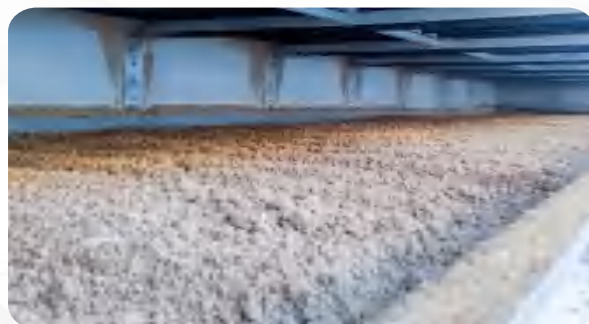
Capacity: 100,000 Birds Length of Block: 35M