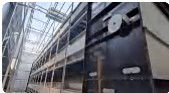
Capacity: 950,000 Birds, 2 Blocks Length of Single Block: 42M