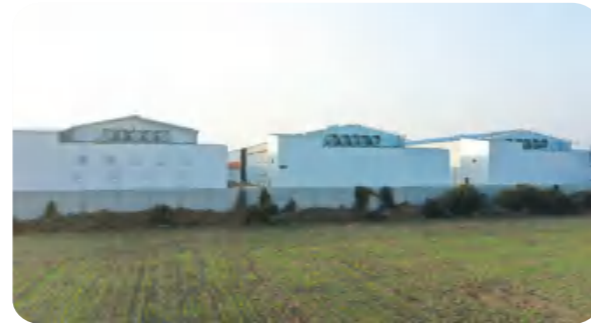
Capacity: 330,000 Birds, 3 Blocks Length of Single Block: 25M