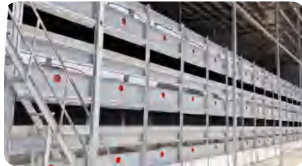
Capacity: 1,800,000 Birds, 10 Blocks Length of Single Block: 25M