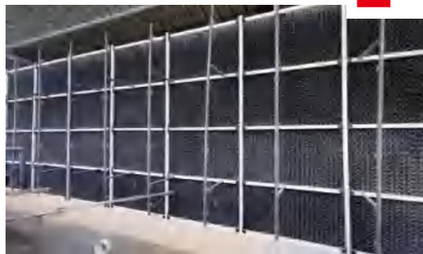
Feather Collection Equipment