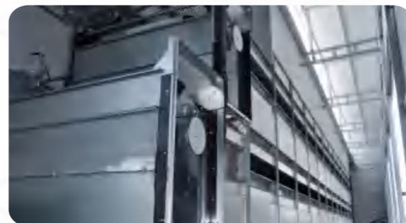
Capacity: 80,000 Birds Length of Block: 30M