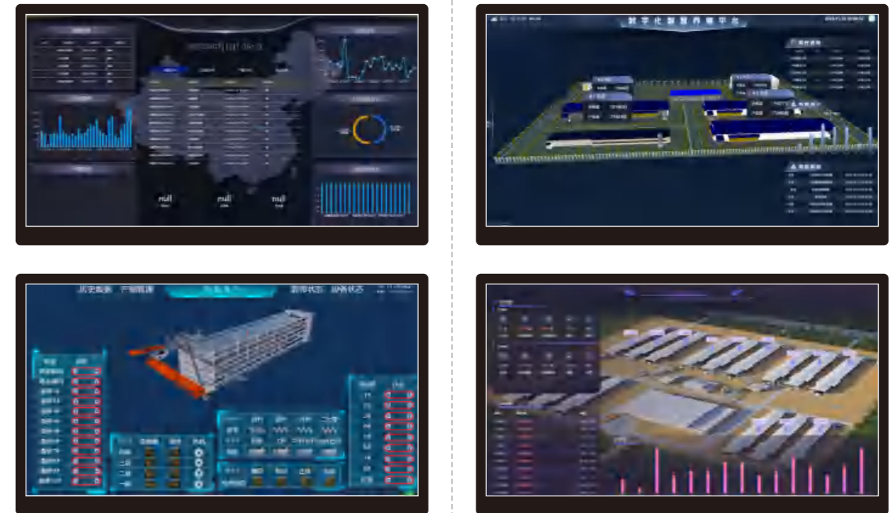
Intelligent Manure Drying Platform