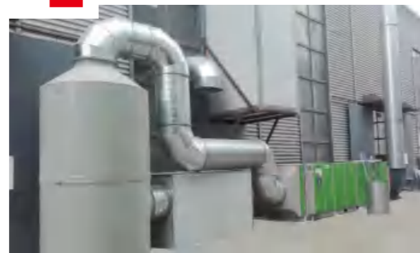
Waste Purification System