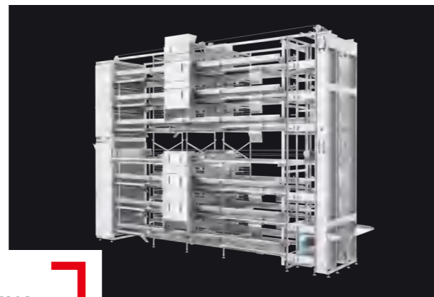
Super-High Constant Temperature Layer Cage System (6/8/9/10/12 tiers)