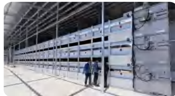
Capacity: 420,000 Birds Length of Block: 50M