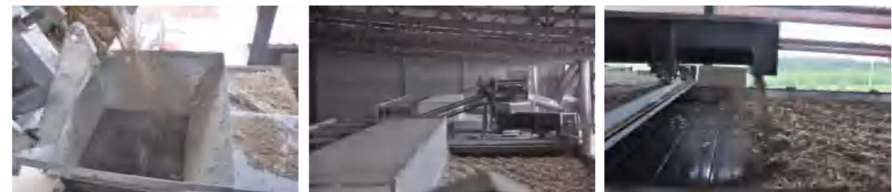
DISTRIBUTION DEVICE: Even distribution of manure on the drying plate leads to uniform and efficient drying