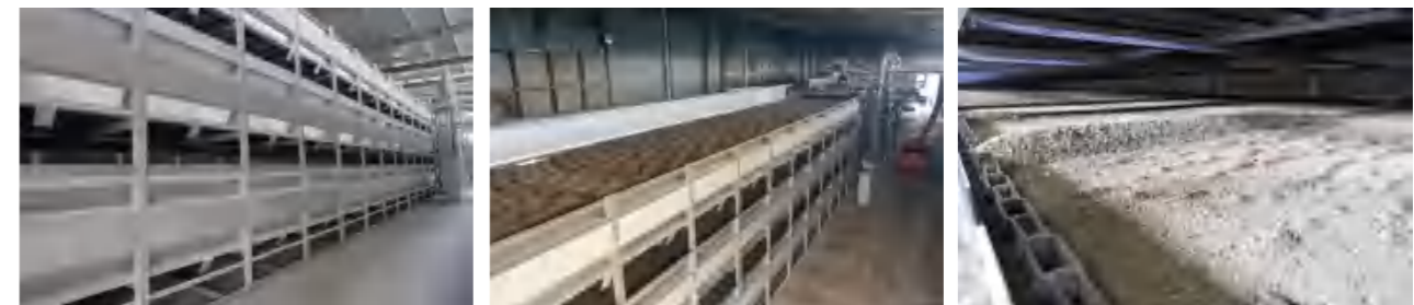
AIR-DRYING: Intelligent and efficient air-drying in tiers